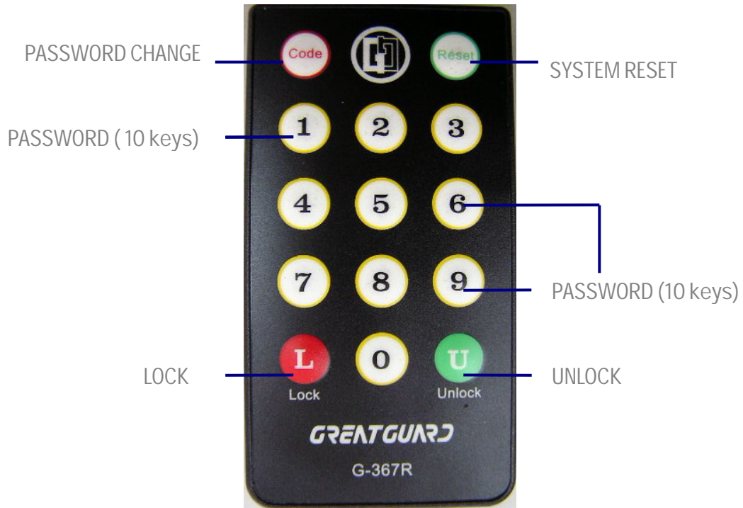
IR remote controller